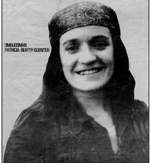
Martlet , February 24, 1978